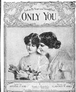
Waltz Song Hit

Copyright, MCMXV by Frank K. Root & Co. British Copyright Secured