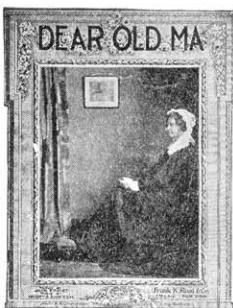
Popular "Mother" Song