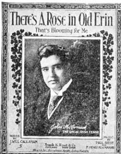
Another "River Shannon"