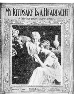
Popular Waltz Ballad