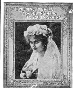
Novelty Ballad Success

Copyright, MCMXV by Frank K. Root & Co. British Copyright Secured