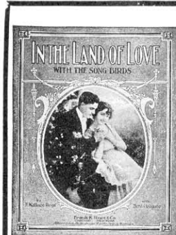
With Bird Obligato